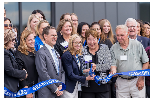
Buffalo Dental Clinic Ribbon Cutting Ceremony September 16, 2022

Though the clinic is up and running, we still need your support! Your donation to the Buffalo clinic will help people in need because the patients we serve have significant untreated dental disease and have trouble getting access to dental care. Your contribution will help us meet the needs of those suffering now in the community.